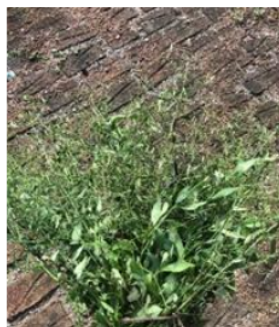
Figure 1. The process of drying Sambiloto leaves

The extract that is still mixed with the solvent is distilled at a temperature that matches the solvent's boiling point to obtain a thick extract, while the thick extract produced from this distillation process is 30 mL. Furthermore, Sambiloto leaf extract was tested against nails in a corrosive HCl medium and well water soaked for seven days. This test was carried out to determine the efficiency of the Sambiloto leaf extract inhibitor against the corrosion rate of nails by adding the Sambiloto leaf extract, which has varied concentrations of 1%, 5%, 10%, and 15% in the corrosive medium that has been provided, as shown in Figure 3.