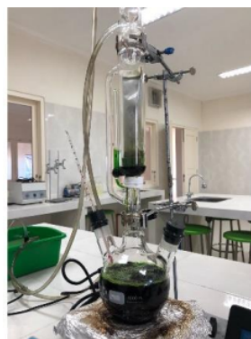
Figure 2. The process of extracting Sambiloto leaves using the soxhletation method

The inhibitor's ability to determine the corrosion rate of nails in the corrosive medium can be determined quantitatively using the following equation [8].